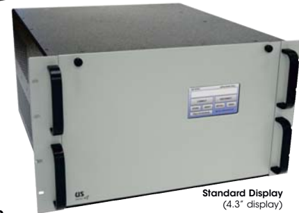
Standard Display (4.3" display)

For a bigger display add the "Option X" to upgrade the standard 4.3" display to a beautiful 10.1" with even more features (shown to left).