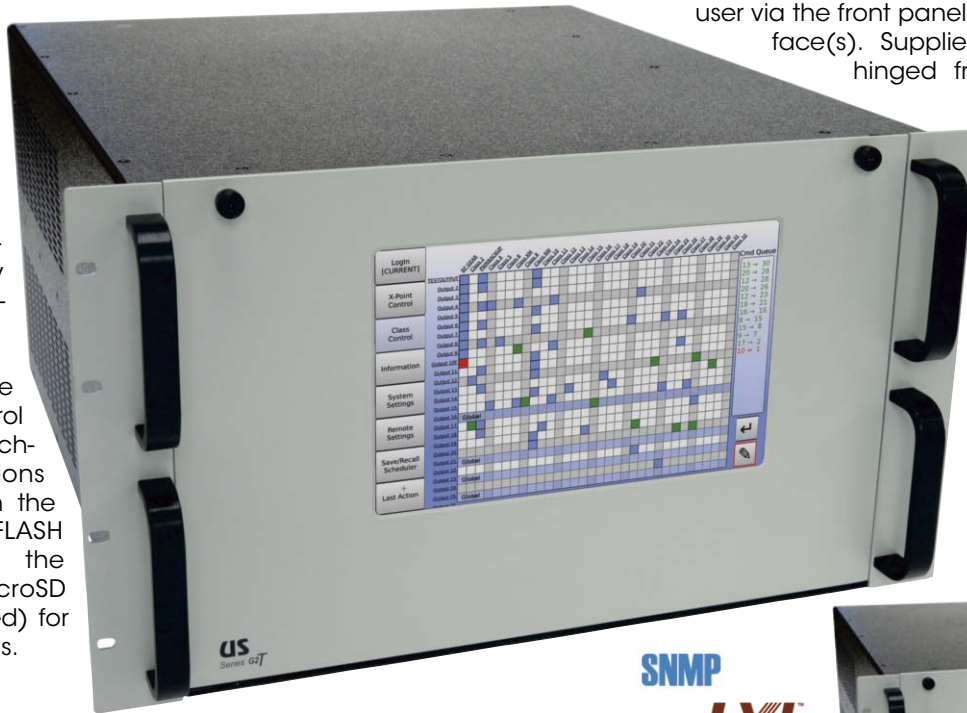
Shown with Option X (10.1" display)

On each CPU, the user system control options and switching configurations can be stored in the non-volatile FLASH memory or in the removable microSD card (not included) for secure installations.