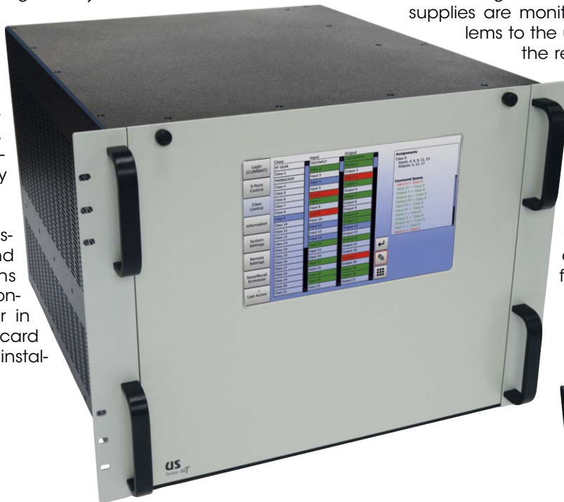
Shown with Option X (10.1" display)

For a bigger display add the "Option X" to upgrade the standard 4.3" display to a beautiful 10.1" with more features (shown to left).