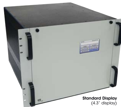
Standard Display (4.3" display)

Universal Switching's policy is one of continuous development, and consequently the company reserves the right to vary from the descriptions and specifications shown in this publication.