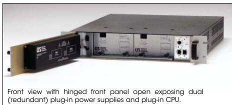
Front view with hinged front panel open exposing dual (redundant) plug-in power supplies and plug-in CPU.

The suffix number is used to define the supply type and whether it is a single or dual configuration. The power supplies are monitored and report any problems to the user via the front panel and the remote interface(s). The supplies install through the hinged front panel which is ideal for critical applications. Only one supply is needed for full operation.